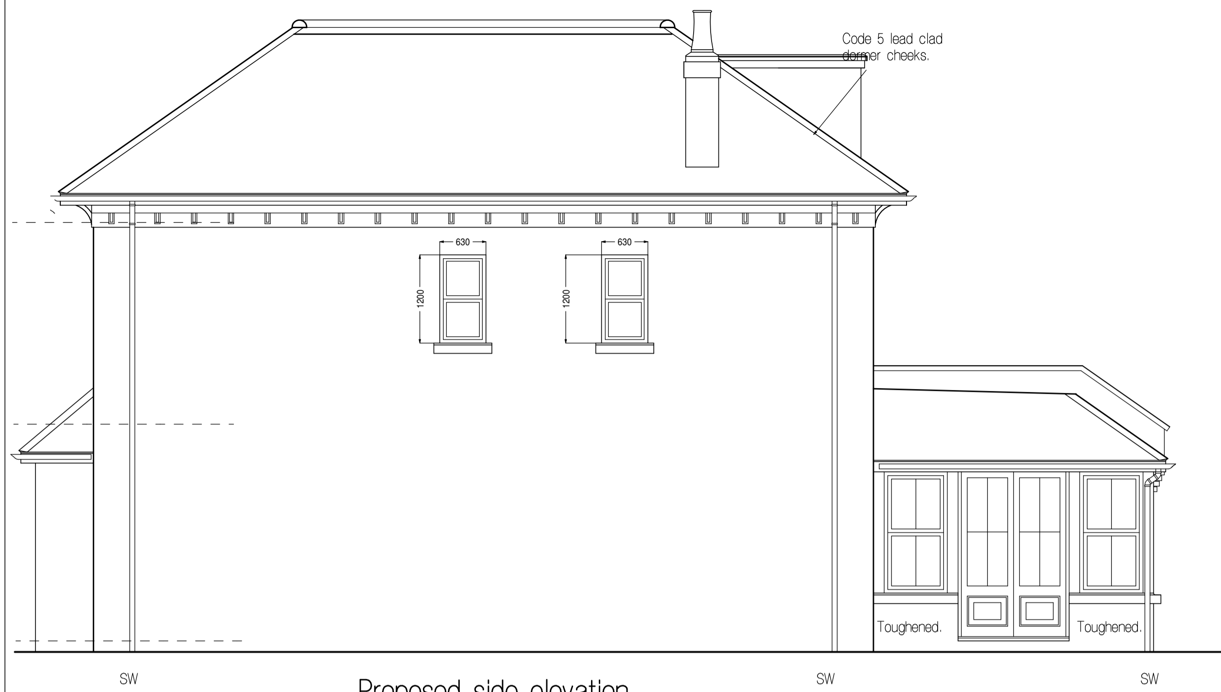
Proposed side elevation.

General Notes. PLEASE READ THIS FIRST. If in doubt please ask. No work shall commence until the relevant approval has been granted. Any work carried out prior to this approval shall be at the Client's / Contractors own risk.